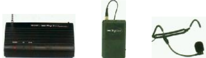
TXS110 receiver TXS110 transmitter TXS110HM headmic