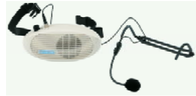
WAP3 waistband amplifier