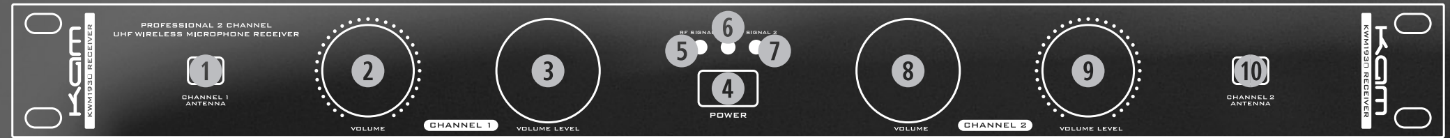
KWM1930 FRONT PANEL