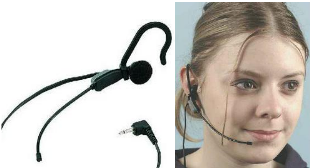
IMG Stageline HM20 Headmic

Headworn microphones with electret cartridge with especially unobtrusive attachment to the ear.