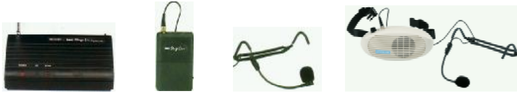
TXS110 receiver TXS110 transmitter TXS110HM headmic WAP3 waistband amplifier

Sound Services, 43 Albany Road, Fleet, Hants, GU51 3PU, UK phone: 01252 620227 fax: 01252 627505 email: sales@soundservices.co.uk www.soundservices.co.uk www.soundservices.org.uk VAT: 479 7742 77